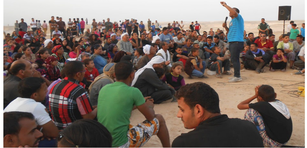
Image: Believers continue to meet together in the desert after their church was destroyed.